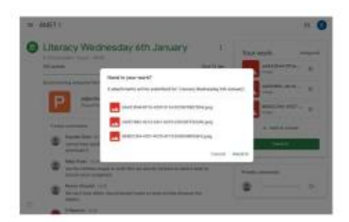
And you are done!