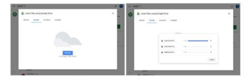
Step 4 - Hand in the work