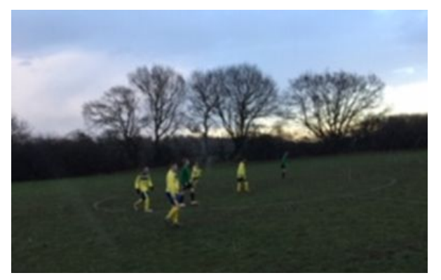
It was a very tough match, not helped by the conditions, but all the boys played well. Unfortunately we were not able to secure a win but are looking forward to the next match.

Thank you to all the parents who braved the cold to support.